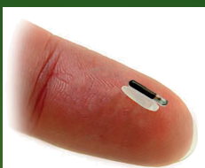
A microchip compared to a grain of rice

A small computer microchip is embedded under your pet's skin, usually between their shoulder blades. The chip contains a unique ID number that identifies your pet and is linked to the owners information. If your pet is ever lost and enters a shelter or clinic, your pet will be scanned and your information can be easily located to contact you! As a responsible pet owner, ensure all your pets are microchipped and that you keep this information up to date!